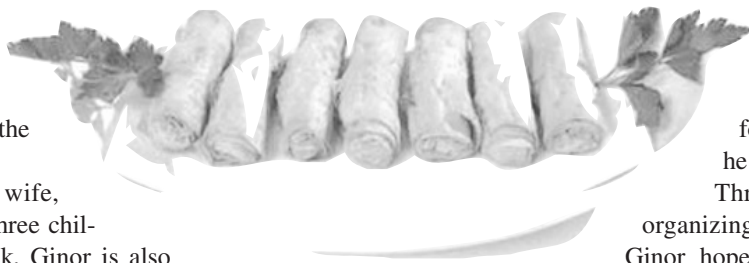
Moroccan cigars — layers of paper-thin dough filled with spicy meat (above) — are a favorite among fans of Middle Eastern food.